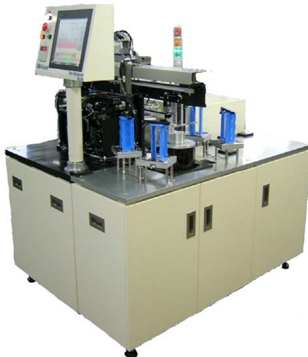
Model #4101 CNC-Controlled 4-Cassette System