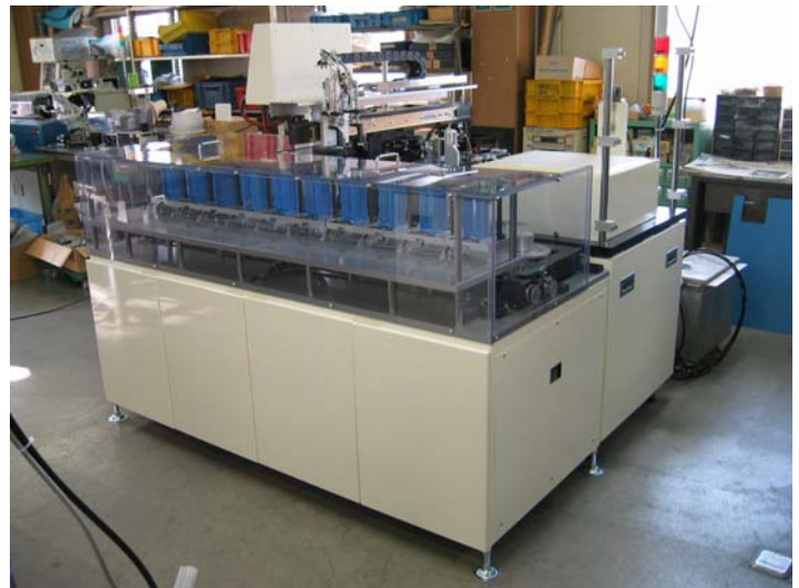
View of CNC Controlled 10 Cassette to Cassette System