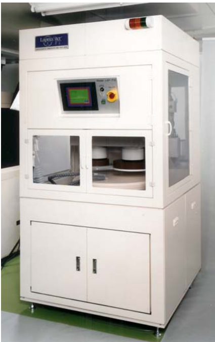
Model 712 System