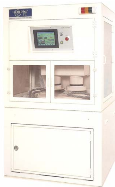
Model 612 System