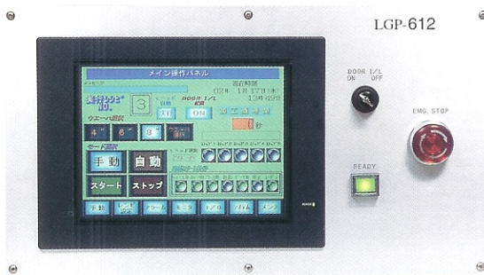
Model 612 Control Panel/Touch Screen